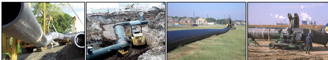
Figure 4 Large Diameter Industrial PE Pipe Applications

Some of the discrepancy in sizes is attributable to the predominance of smaller diameter distribution mains compared to the larger distribution mains. While the confidence in polyethylene pipe is very high, there may be a perception that there are logistical and operational obstacles to integrating large diameter polyethylene mains into gas distribution systems in full compliance with federal regulations. This paper