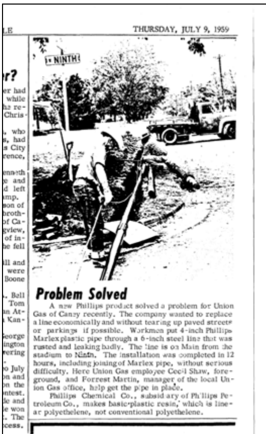
Figure 1 Caney Kansas insert renewal

The first polyethylene gas distribution lines were installed in the 1950's. Figure 1 shows documentation of a pipeline insert renewal installed in July of 1959. With over fifty years in service, polyethylene pipes have proven their reliability and durability. Polyethylene pipes have become the material of choice for the United States Gas Distribution market. Polyethylene alone represents over 39 million services and 3 billion feet (914,000 km) of the pipes in service 1 ; and over 97 percent of all new gas distribution piping installed each year.