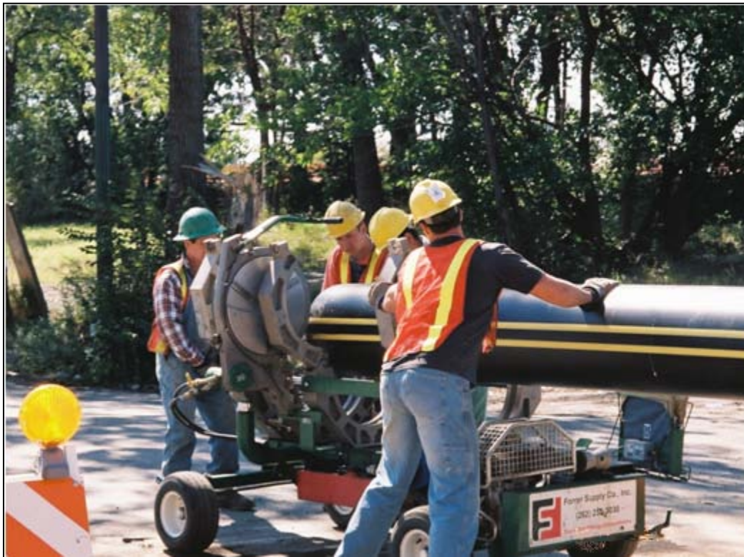
Figure 6 18 inch fusion at Peoples Gas, Chicago 7

The most current application in Chicago involves relining 5100 feet of a 24-inch cast iron line that is buried 5 feet deep in an area of heavy traffic in the city. The longest section to be pushed in is 1800 feet, and the pits are typically 40 to 60 feet long. Eighteen inch diameter applications are quickly becoming routine for Peoples Gas in Chicago.