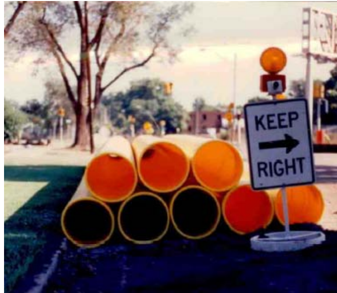
Figure 3 Early large diameter main installation

One of the earliest installations occurred in 1989 where a 20 inch diameter pipe sliplined into existing mains in the state of Colorado where large diameter pipe was slip-lined into an existing cast iron main to renew the pipeline. 4