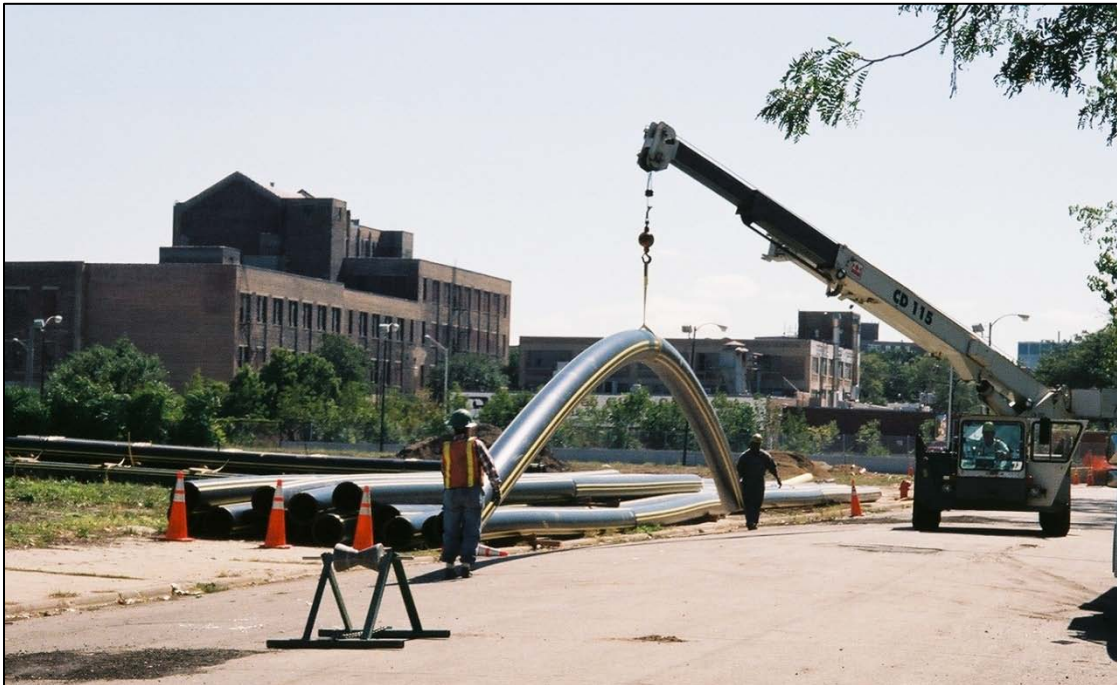
Figure 5 18 inch PE pipe in Chicago, IL

Peoples Gas of Chicago has used polyethylene extensively throughout their operations. As a result the utility recognized the benefits of polyethylene pipe for its corrosion resistance, cost effectiveness, and ease of installation. For Peoples the driving force to move to larger diameters was the need for a cost effective replacement of older cast iron pipelines. Peoples Gas distribution lines have an MAOP of 25psi, however many sections of the city are still serviced by low pressure mains (inches of H 2 O). By